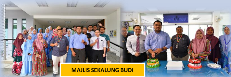
MAJLIS SEKALUNG BUDI

SELAMAT ULANG TAHUN KELAHIRAN JANUARI 2023