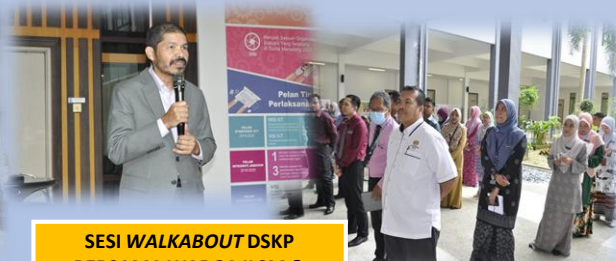
SESI WALKABOUT DSKP BERSAMA WARGA ILSM & DOSM PERAK